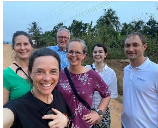
GWC staff members travelled to Ghana to celebrate the program launch.

This program will empower young Ghanaians to become certified technicians who will help keep the country's water systems safe & running for good .