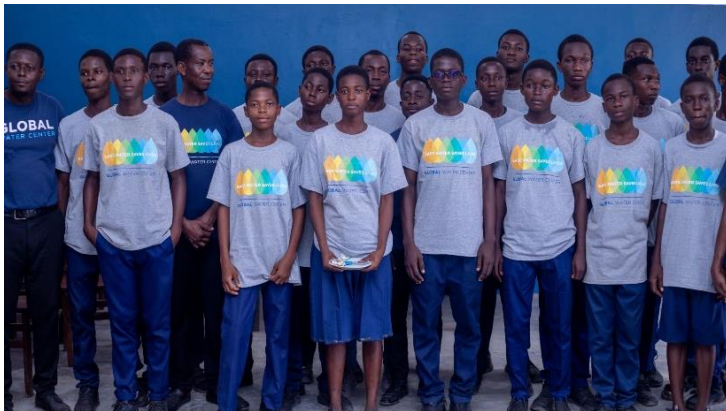
First class of future water technicians in Ghana.

Currently in Ghana, 19.7% of youth are unemployed and 8 million people lack access to safe water, but an innovative water education program is poised to change that.